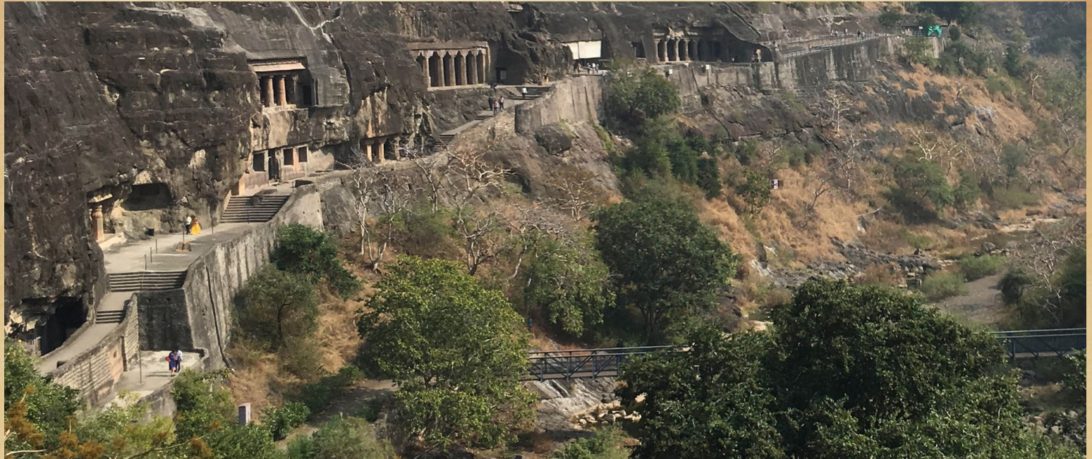
Ajanta Caves, Aurangabad district, Maharashtra