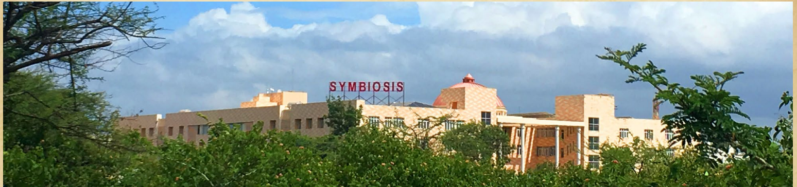
SSLA at Symbiosis International University, Viman Nagar New Campus