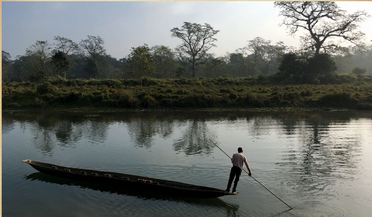
Chitwan wildlife reserve, Nepal