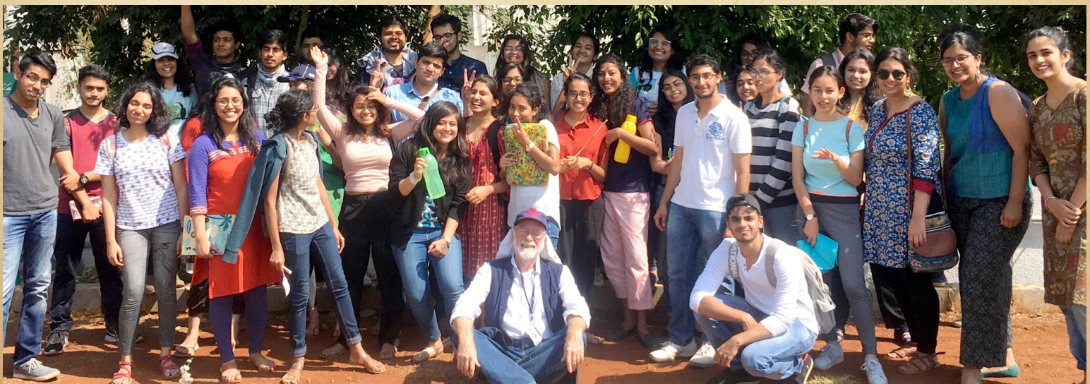
First Big History class at SSLA

Founded in 1971, Symbiosis was begun with the intent of providing a 'home away from home' for African and Asian students studying in India.