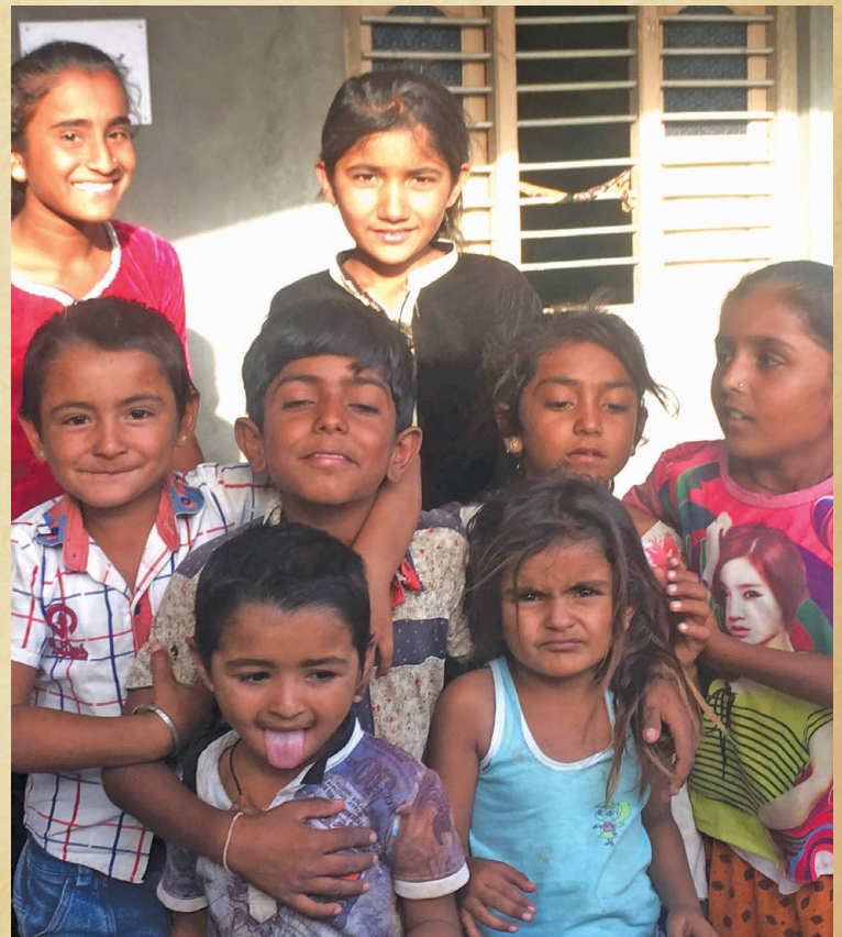
Kids in Kachchh village at wool trade market