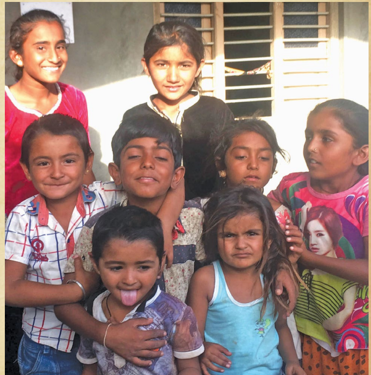
Kids in Kachchh village at wool trade market

Each location can accommodate up to about 30 participants. Attendees will stay at a local organization that is active in local change-making and will learn about their activities, including visits to their field stations. There will also be visits to heritage sites and trekking in ecological areas, in addition to panel presentations by conference and community members.