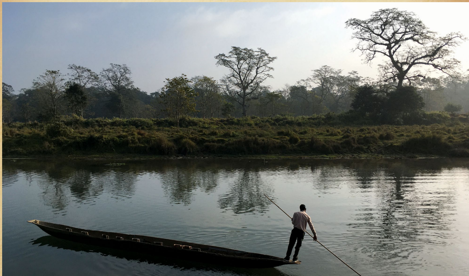
Chitwan wildlife reserve, Nepal

The seminars are located near major cities, so participants can fly home from there, or proceed to other destinations. Travel into and out of India as well as between Indian cities is reasonably priced, especially if reservations are made well in advance. We will provide links to experienced travel agents.