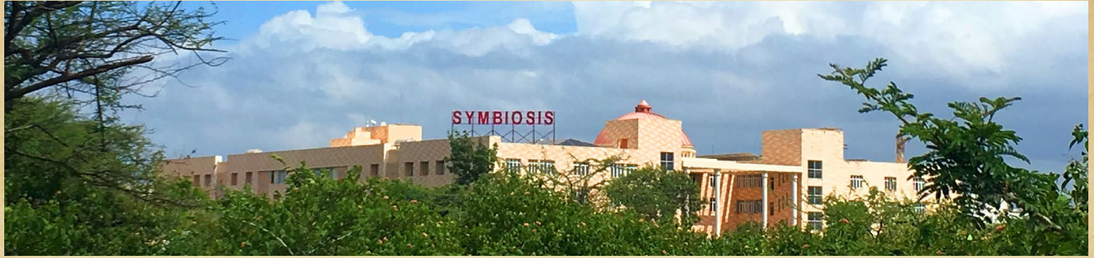
SSLA at Symbiosis International University, Viman Nagar New Campus

Big History seeks to understand the integrated history of the cosmos, Earth, life and humanity, using the best available empirical evidence and scholarly methods.