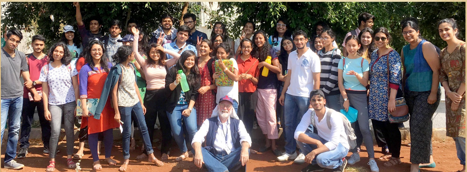
First Big History class at SSLA

Founded in 1971, Symbiosis was begun with the intent of providing a 'home away from home' for African and Asian students studying in India.