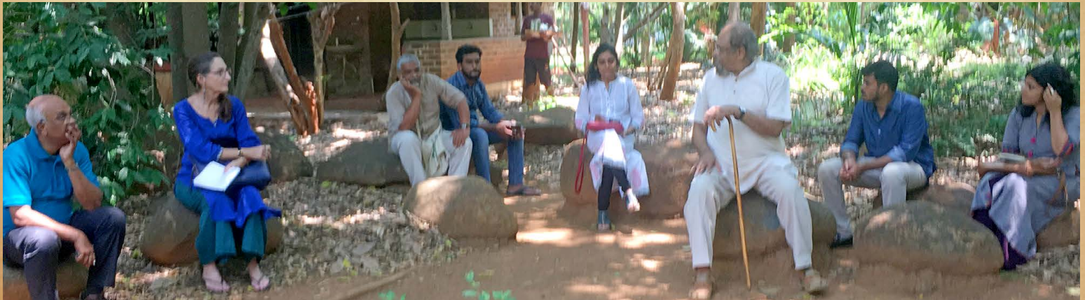
Discussion at the Fireflies Intercultural Centre, Dinnepalaya, Karnataka, June 2018