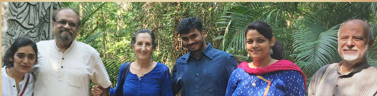
Indian big historians and community activists, Spring 2018