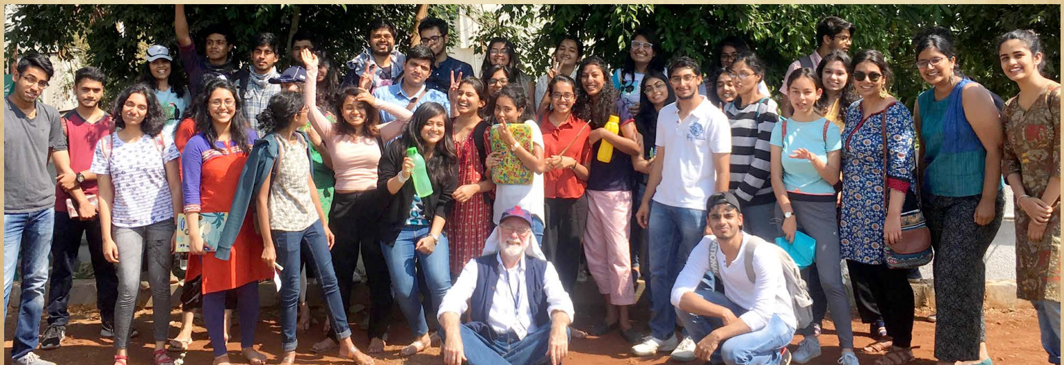
First Big History class at SSLA, Spring 2018

Founded in 1971, Symbiosis was begun with the intent of providing a 'home away from home' for African and Asian students studying in India.