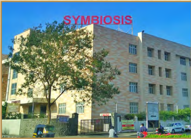
Symbiosis International University, Viman Nagar New Campus