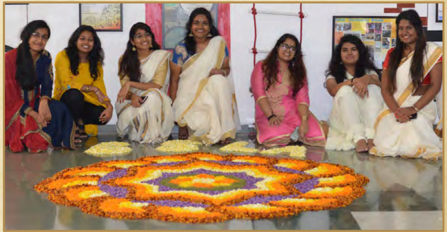
Students and mandala at Onam Festival, Symbiosis School for Liberal Arts.

We are delighted that you will be with us in India for the 2020 Big History Conference! Its theme is Changing the World: Community, Science and Engagement with Big History . For conference details and registration, please go to the IBHA website at < bighistory.org >. This guidebook is to help you plan your time with us in South Asia.