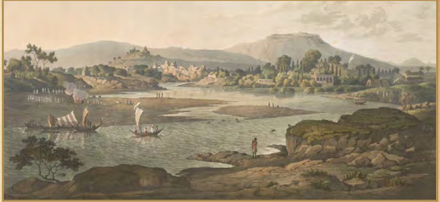
Pune landscape, Henry Salt, c. 1804