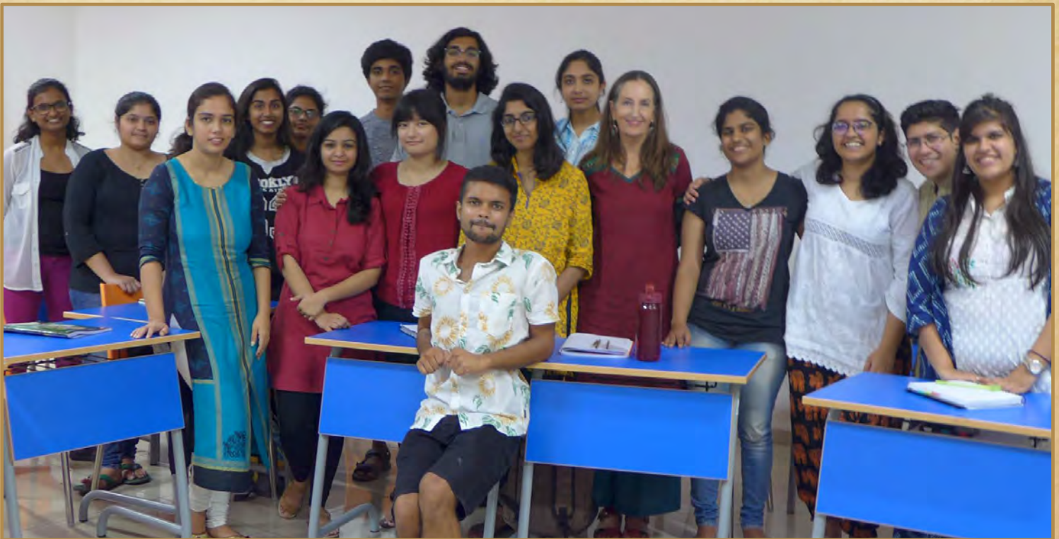
SSLA students at the New Campus

SSLA's students will attend the conference, so sessions will be held in our classrooms and halls, while keynote panels, performances and special events will take place at the Viman Nagar campus auditorium.