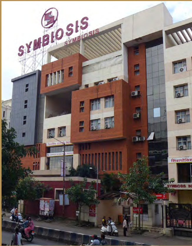
Symbiosis campuses, Viman Nagar: Old campus