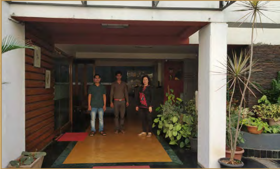
Hotel Silver Crest in Viman Nagar, Pune

We have reserved a university-approved guesthouse, the Hotel Silver Crest, near to the conference site. It can accommodate up to sixty people in double-occupancy rooms at about ₹2000 ($30) a day. The rooms are arranged in suites of three bedrooms with shared sitting room and bathroom. A restaurant is next to the lobby. As folks register for the conference, the Silver Crest rooms will fill up, hence the need to register as soon as possible to reserve a room.