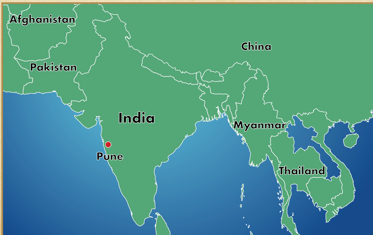
Pune in South Asia