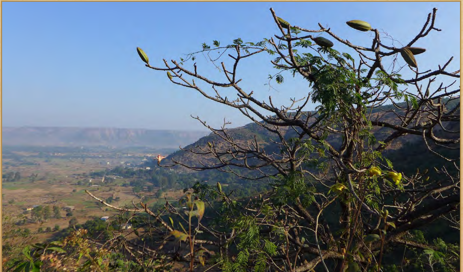
The Sahyadri Mountains from a trail between the Bhaja Caves and Fort Lohagad.

The seasons in India are different than elsewhere because of the monsoons, which run from June to October in Pune. For the conference in August, it will be about 25°C / 75°F with light winds and rain - quite pleasant. Although it is warm, shorts are worn only by children. Bring light, tropical-weight clothes, as well as ultra-light rain gear, a hat or an umbrella. We are in the Sahyadri Mountains on the Deccan Plateau, so it is not as humid as on the coast. Bring sunscreen.