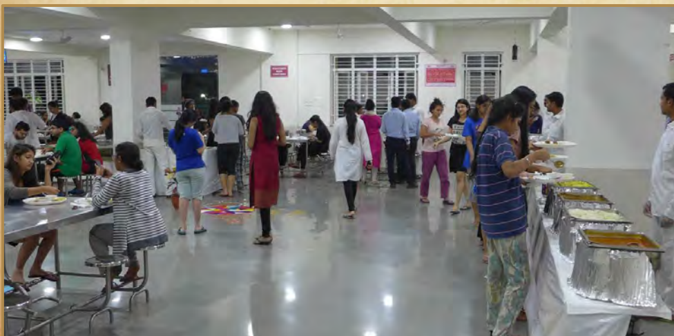
Dining hall at Symbiosis during the Onam harvest festival

Folks may eat at the university dining hall, which serves Indian-style breakfast, lunch, tea, and dinner. The cost is about ₹2000 ($30) a day for four meals. Since the food services must plan in advance, reserve these soon. There is also a canteen and snack bar on campus, where you can get impromptu meals, tea, and juice. In addition, there are restaurants, stores and cafes in the neighbourhood.