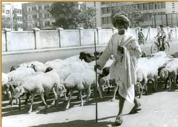
Shepherd and flock, central Pune, c. 1950