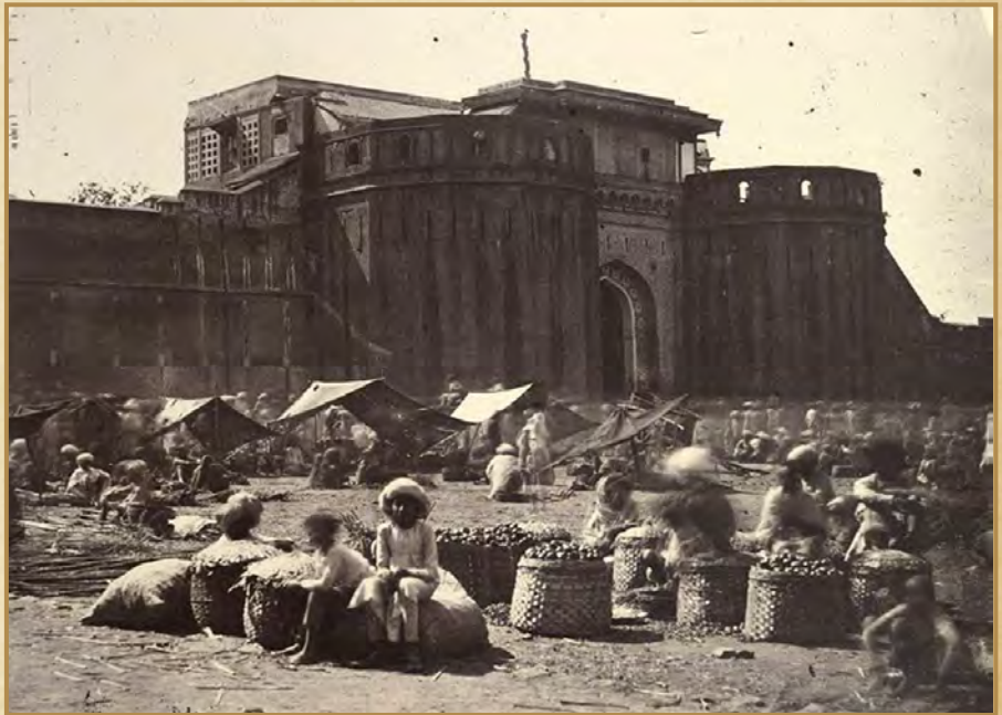
Entrance to Shaniwarwada Fortress, c. 1865