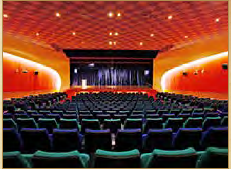
Symbiosis campuses, Viman Nagar: Auditorium