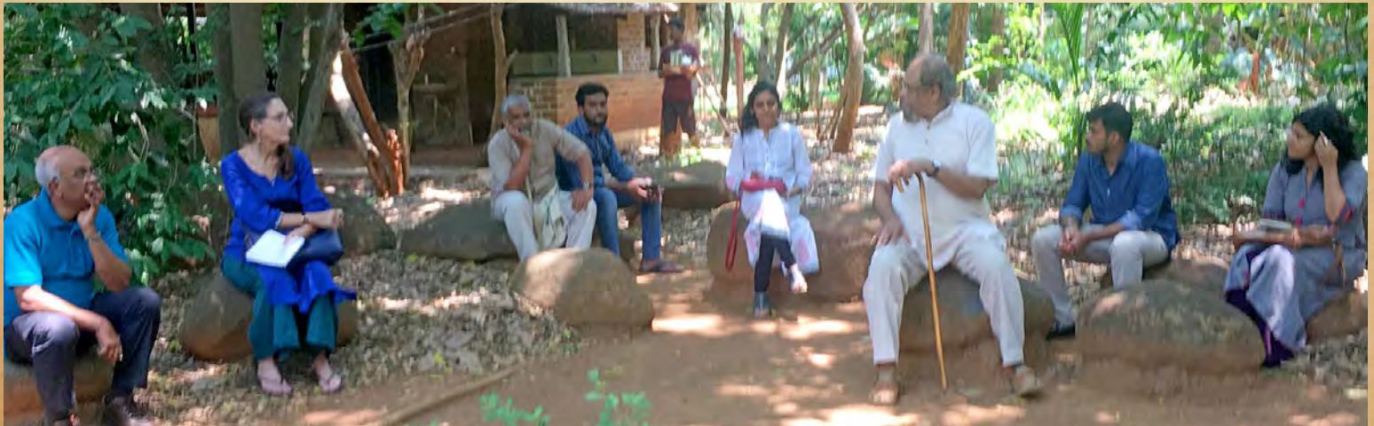
Discussion at the Fireflies Intercultural Centre, Dinnepalaya, Karnataka, June 2018