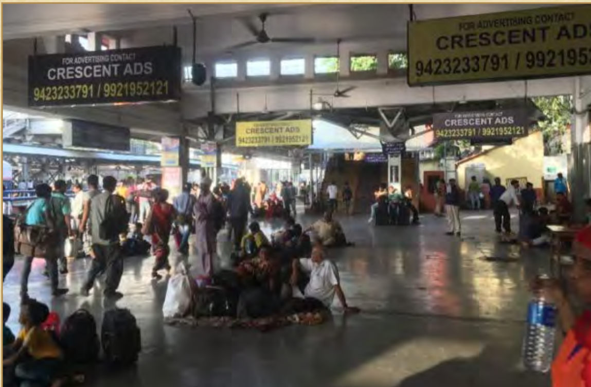
Pune Railway Station

Cross-Culture Travel would be especially helpful for booking flights from your home country to India, while Black Swan Journeys would be helpful within India. Black Swan could also arrange overland travel if preferred, and could set-up a group rate from Pune to the seminars. But to make this happen, folks will have to fill out the conference registration forms soon!