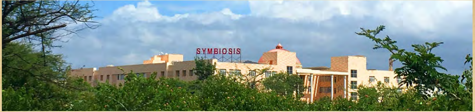
SSLA at Symbiosis International University, Viman Nagar New Campus, Autumn 2019

Big History seeks to understand the integrated history of the cosmos, Earth, life and humanity, using the best available empirical evidence and scholarly methods.