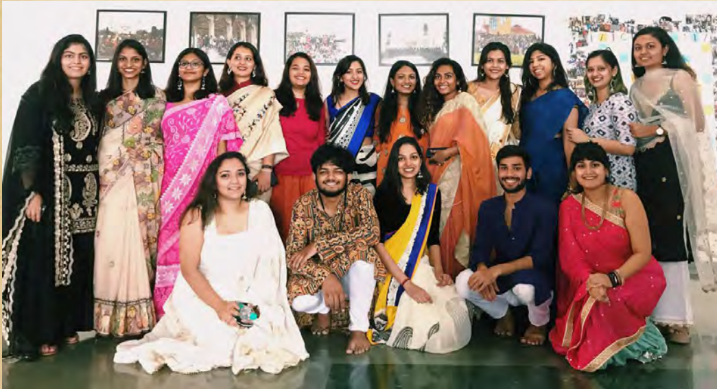
Students on Traditional Day at SSLA

A versatile item of Indian clothing is the tuwal from Kutch, a lightly-woven, cotton cloth worn on the shoulder or around the neck, which, unlike a scarf or stole, is used for wiping hands and face. Indian clothing may be purchased at many stores while in India.