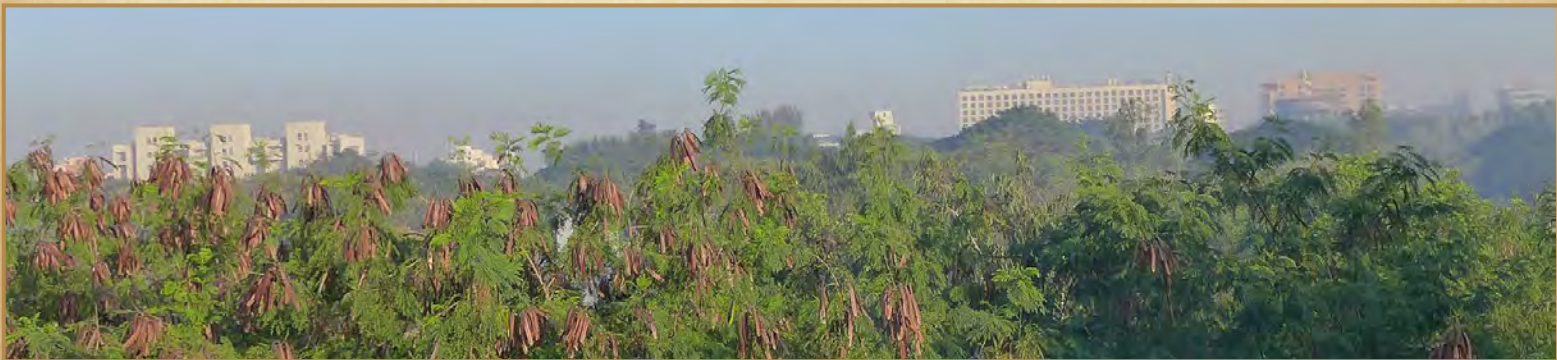
Pune as seen from the north side of the Mula-Mutha River

A military garrison and quiet garden city for retirees, Pune had only about a million people in 1970. Expansion of engineering firms, manufacturing companies, schools and the IT industry drew many workers, students and service providers to the city, causing it to grow to over six million residents today and making it India's ninth largest city.