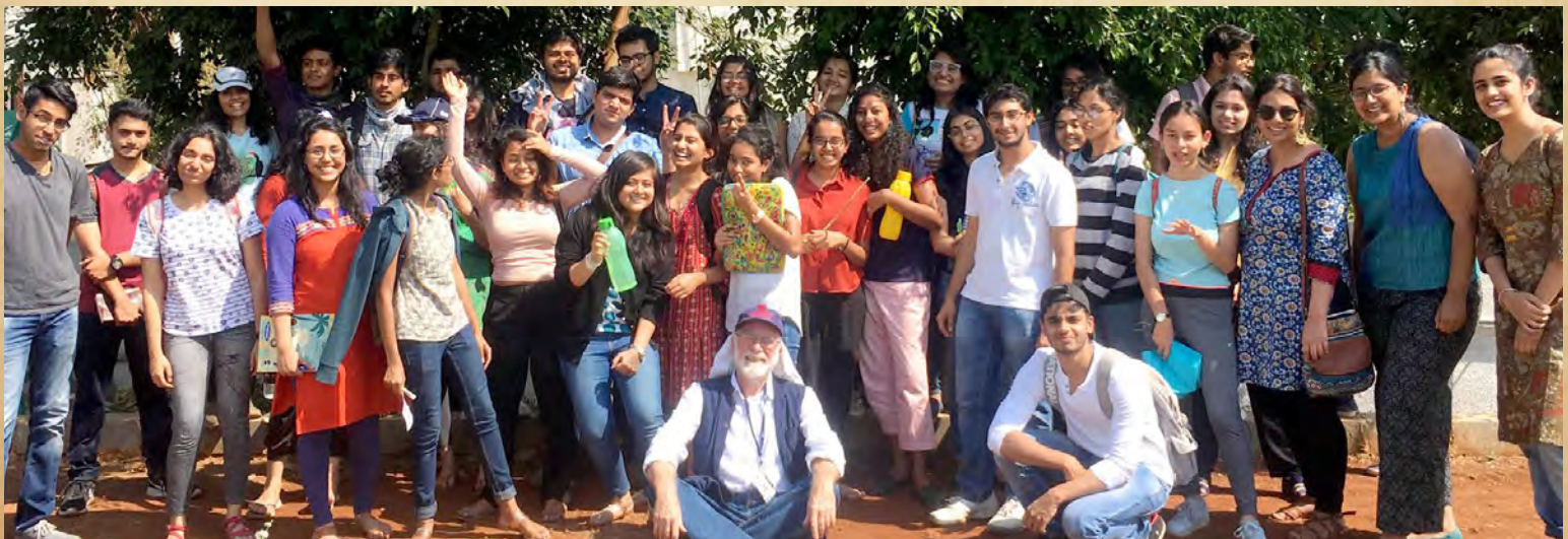
First Big History class at SSLA, Spring 2018

Founded in 1971, Symbiosis was begun with the intent of providing a 'home away from home' for African and Asian students studying in India.