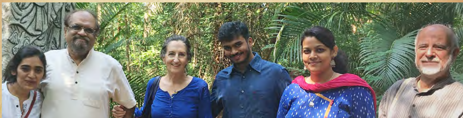
Indian big historians and community activists, Spring 2018