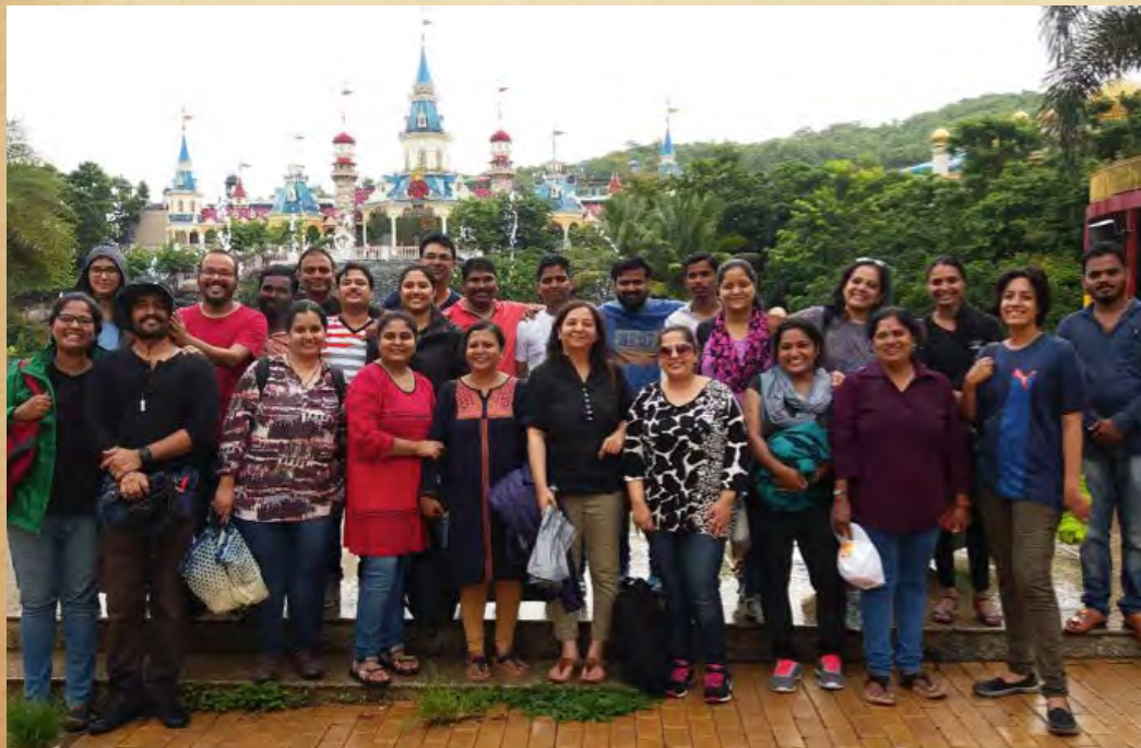
SSLA staff at staff picnic.