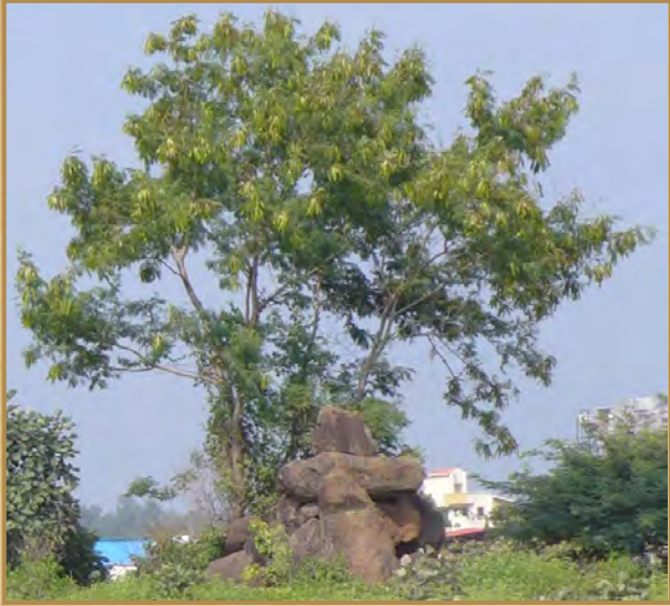
Bronze Age megalith, Lohegaon