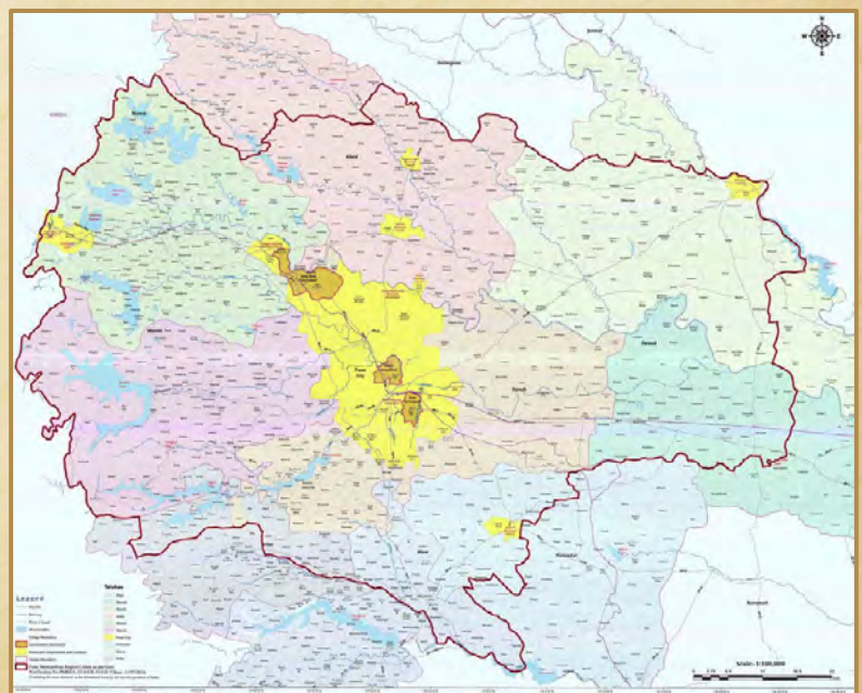
Pune city map