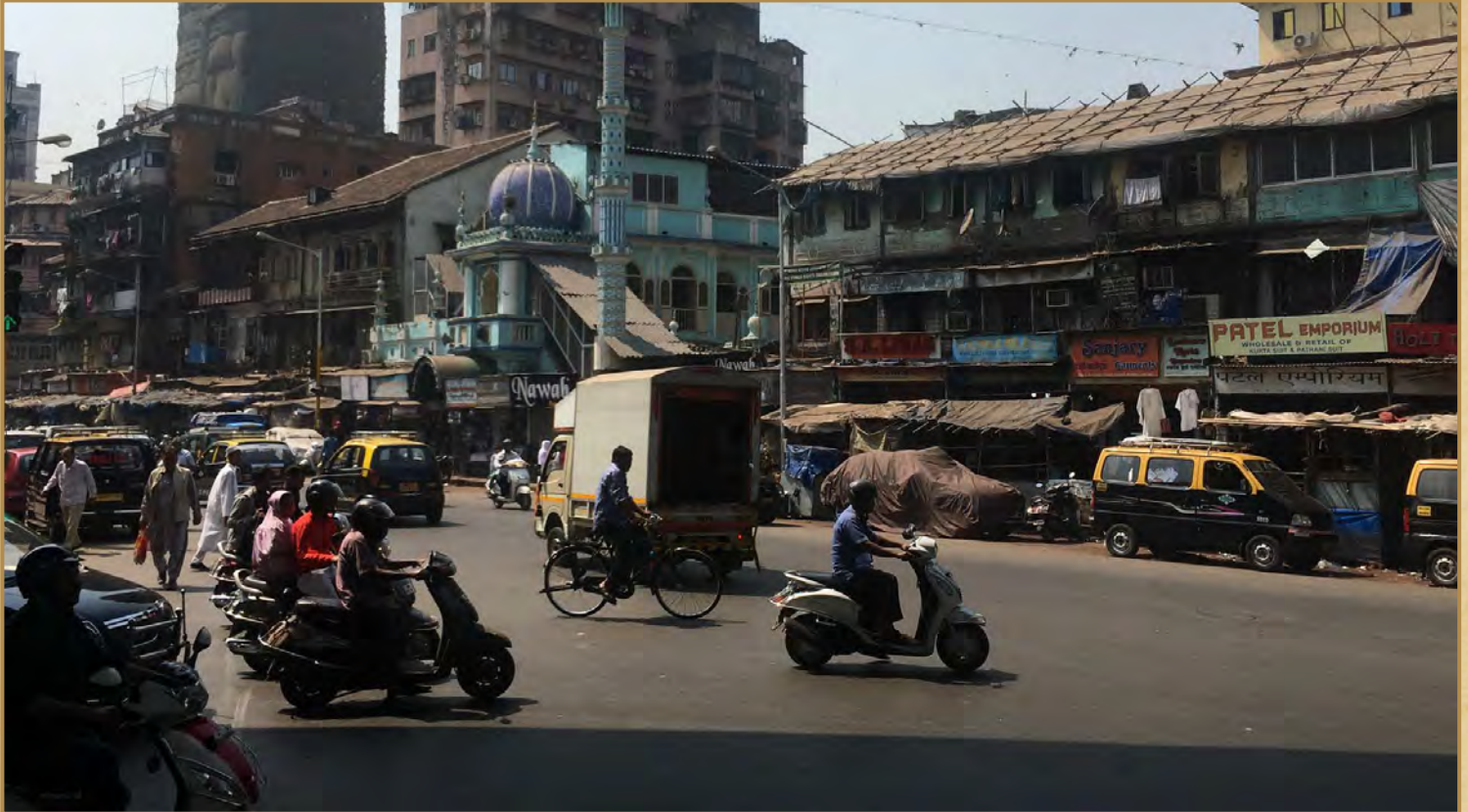
Downtown Pune, which has the more two-wheelers than any other city in the world!

Pune is called the 'Oxford of the East', because of its many universities, colleges, schools, and training facilities. Our conference will be held at one of these new institutions, the Symbiosis School for Liberal Arts: < https://www.ssla.edu.in/ >. The area in which the conference will take place is Viman Nagar, in the north-east corner of the city. Originally this area was part of the agricultural village of Lohegaon and then became home to one of the first airfields in India. Viman Nagar was only opened to development in the last twenty years and is undergoing rapid growth. SSLA is less than a kilometre from the Pune International Airport.