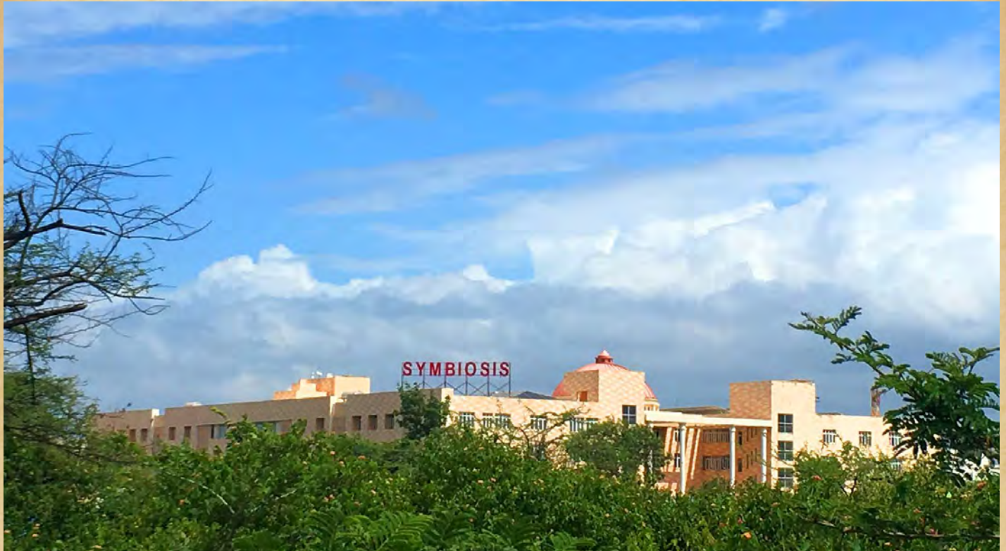
SSLA at Symbiosis International University, Viman Nagar New Campus, Autumn 2019