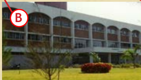
Homi Bhabha Centre for Science Education / TIFR - Mumbai, Maharashtra Science & Changing Society < www.hbcse.tifr.res.in >