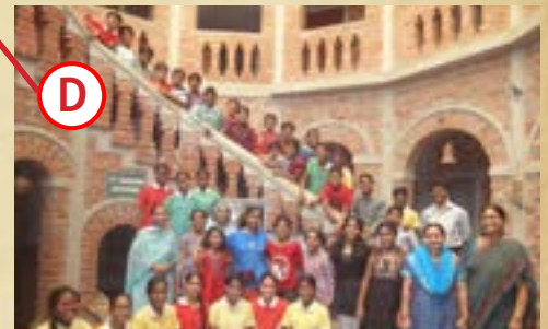
Tarumitra - Patna, Bihar Agrarian Life and Renewal < www.tarumitra.org >