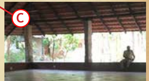
Fireflies-Bengaluru, Karnataka Eco-Spirituality and New Global Needs < www.pipaltree.org.in >