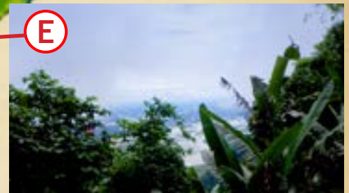
AITF - Guwahati, Assam Indigenous-Tribal Heritage and Innovation < https://tinyurl.com/AITF-org >