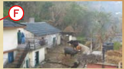
JAS - Shimla, Himachal Pradesh Gender, Environment and Social Transformation < www.jasindia.org >