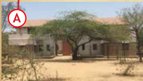
Khamir - Bhuja, Kutch, Gujarat Landscape and Adapting Heritage < www.khamir.org >