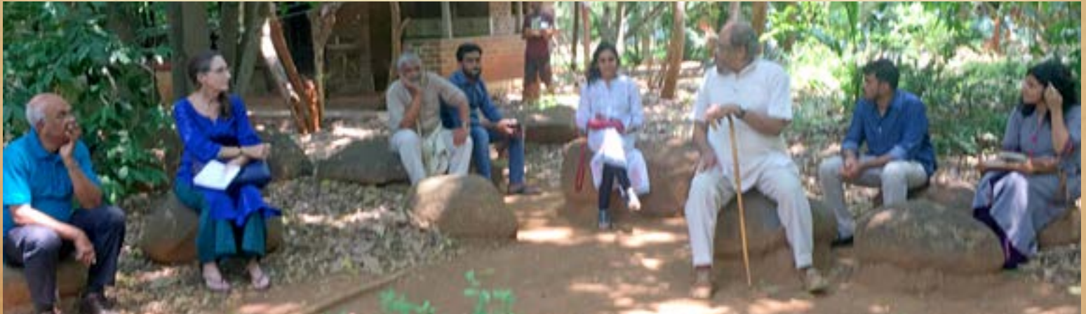
Discussion at the Fireflies Intercultural Centre, Dinnepalya, Karnataka, June 2018