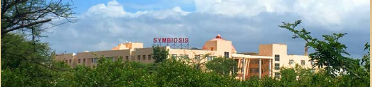
SSLA at Symbiosis International University, Viman Nagar New Campus, Autumn 2019

Big History seeks to understand the integrated history of the cosmos, Earth, life and humanity, using the best available empirical evidence and scholarly methods.