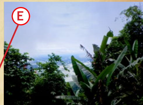
AITF - Guwahati, Assam Indigenous-Tribal Heritage and Innovation https://tinyurl.com/AITF-org