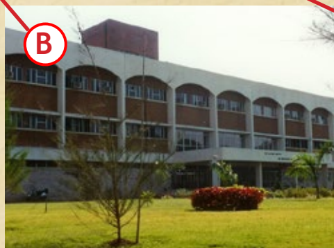
Homi Bhabha Centre for Science Education / TIFR - Mumbai, Maharashtra Science & Changing Society www.hbcse.tifr.res.in