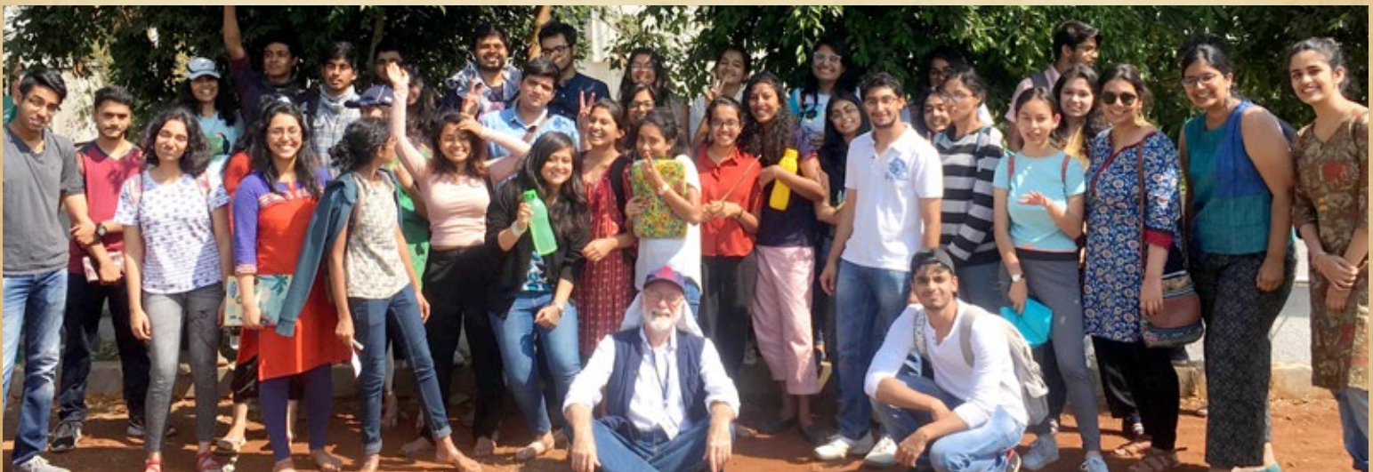
First Big History class at SSLA, Spring 2018

Founded in 1971, Symbiosis was begun with the intent of providing a 'home away from home' for African and Asian students studying in India.