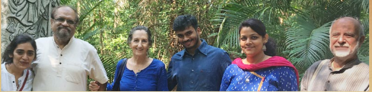
Indian big historians and community activists, Spring 2018