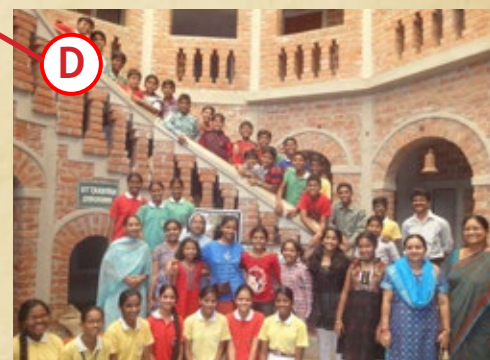
Tarumitra - Patna, Bihar Agrarian Life and Renewal www.tarumitra.org