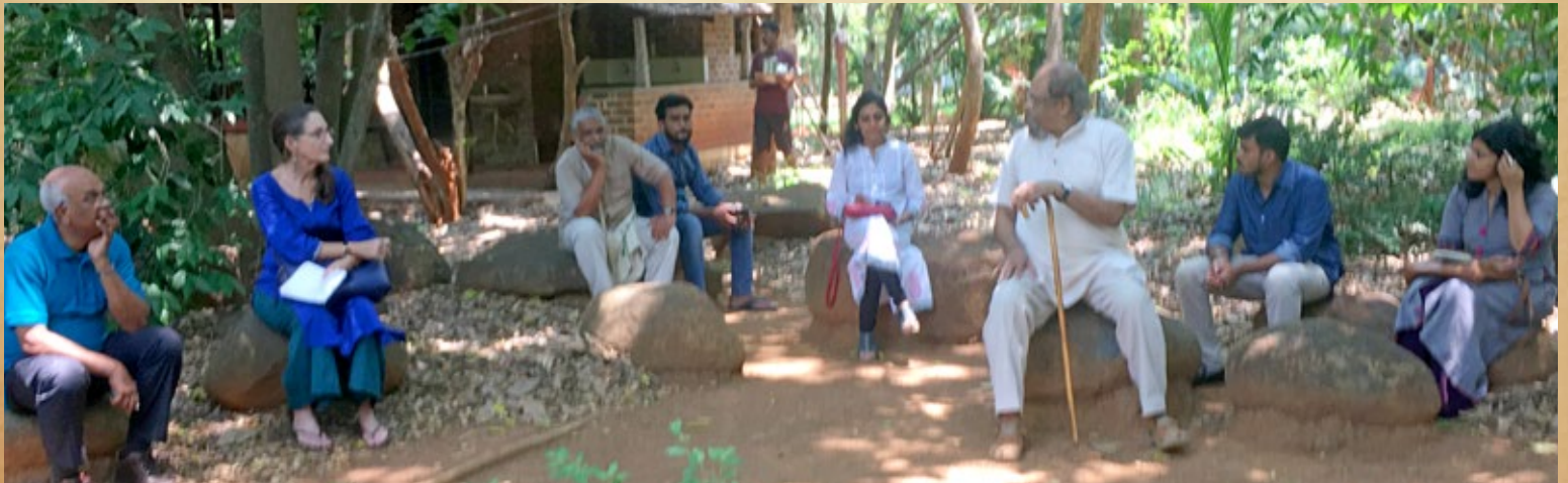
Discussion at the Fireflies Intercultural Centre, Dinnepalya, Karnataka, June 2018