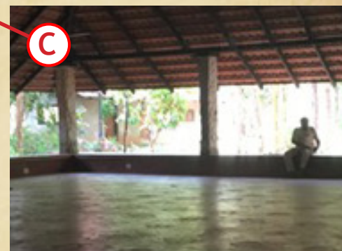
Fireflies - Bengaluru, Karnataka Eco-Spirituality and New Global Needs www.pipaltree.org.in