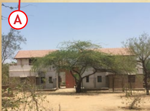
Khamir - Bhuj, Kutch, Gujarat Landscape and Adapting Heritage www.khamir.org