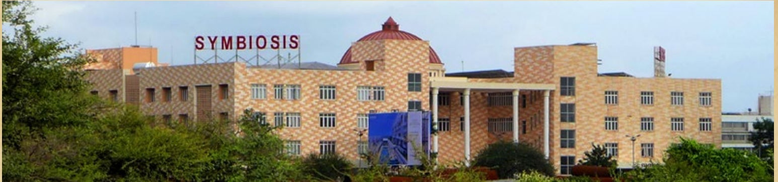
SSLA at Symbiosis International University, Viman Nagar New Campus, Autumn 2017

Big History seeks to understand the integrated history of the cosmos, Earth, life and humanity, using the best available empirical evidence and scholarly methods.