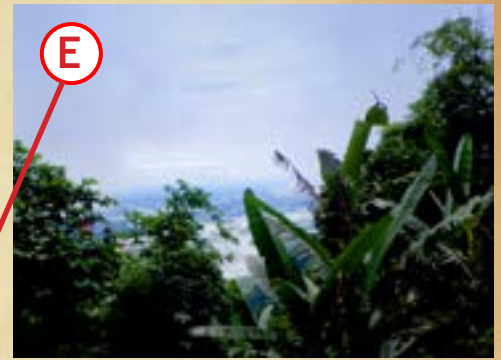
AITF - Guwahati, Assam Indigenous-Tribal Heritage and Innovation https://tinyurl.com/AITF-org