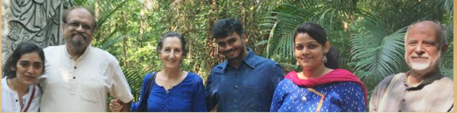
Indian big historians and community activists, Spring 2018