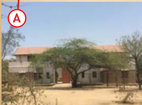
Khamir - Bhuj, Kutch, Gujarat Landscape and Adapting Heritage www.khamir.org