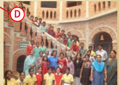
Tarumitra - Patna, Bihar Agrarian Life and Renewal www.tarumitra.org