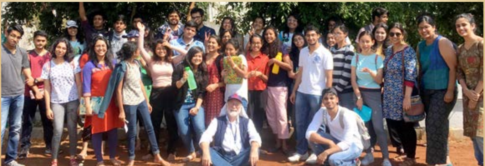
First Big History class at SSLA, Spring 2018

Founded in 1971, Symbiosis was begun with the intent of providing a 'home away from home' for African and Asian students studying in India.