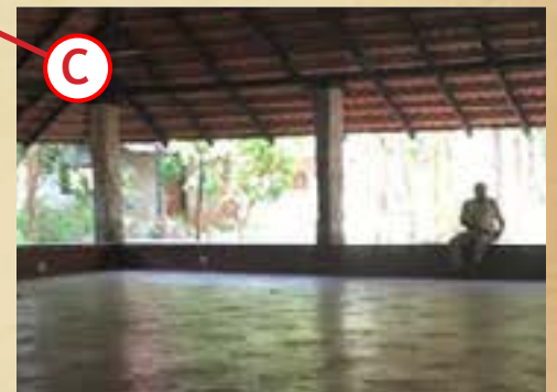
Fireflies/ECC-Bengaluru, Karnataka Eco-Spirituality and New Global Needs www.pipaltree.org.in www.eccbengalure.org