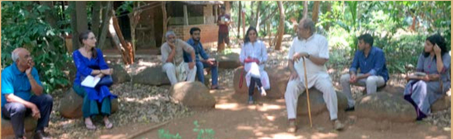
Discussion at the Fireflies Intercultural Centre, Dinnepalya, Karnataka, June 2018