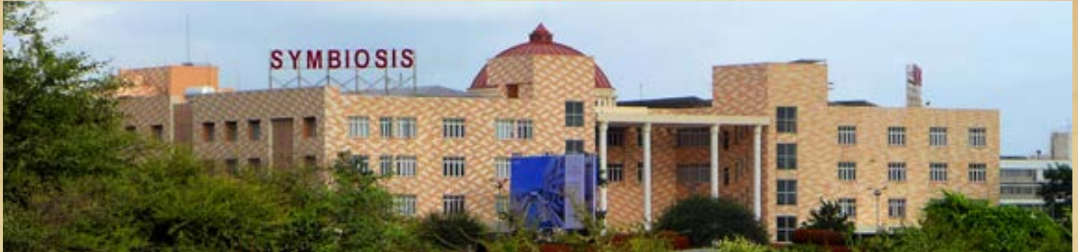
SSLA at Symbiosis International University, Viman Nagar New Campus, Autumn 2017

Big History seeks to understand the integrated history of the cosmos, Earth, life and humanity, using the best available empirical evidence and scholarly methods.