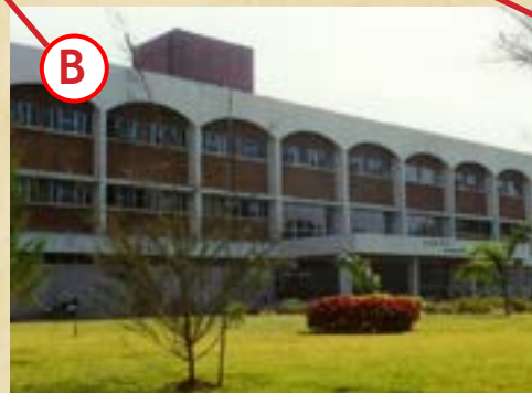
Homi Bhabha Centre for Science Education / TIFR - Mumbai, Maharashtra Science & Changing Society www.hbcse.tifr.res.in