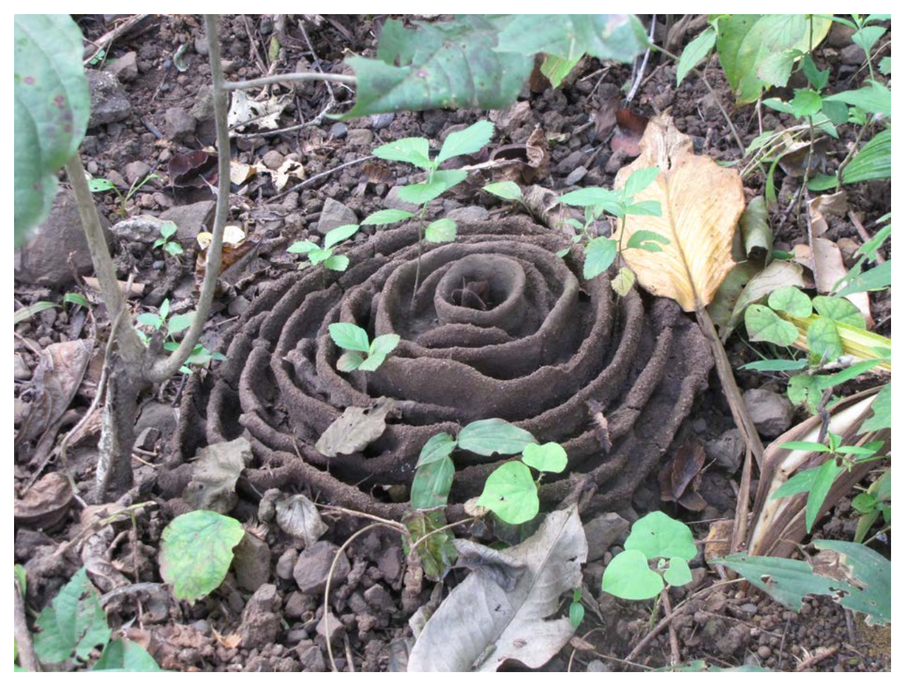
Plate 4: Harvester ant architecture. Bombay Natural History Society (BNHS) land of the Conservation Education Centre on the south-west side of Sanjay Gandhi National Park (SGNP), Rashida Atthar, 2013.

The forest in Mumbai is a southern, moist, deciduous type. A majority of the canopy trees shed their leaves in winter, but other trees, like Bombax ceiba (red