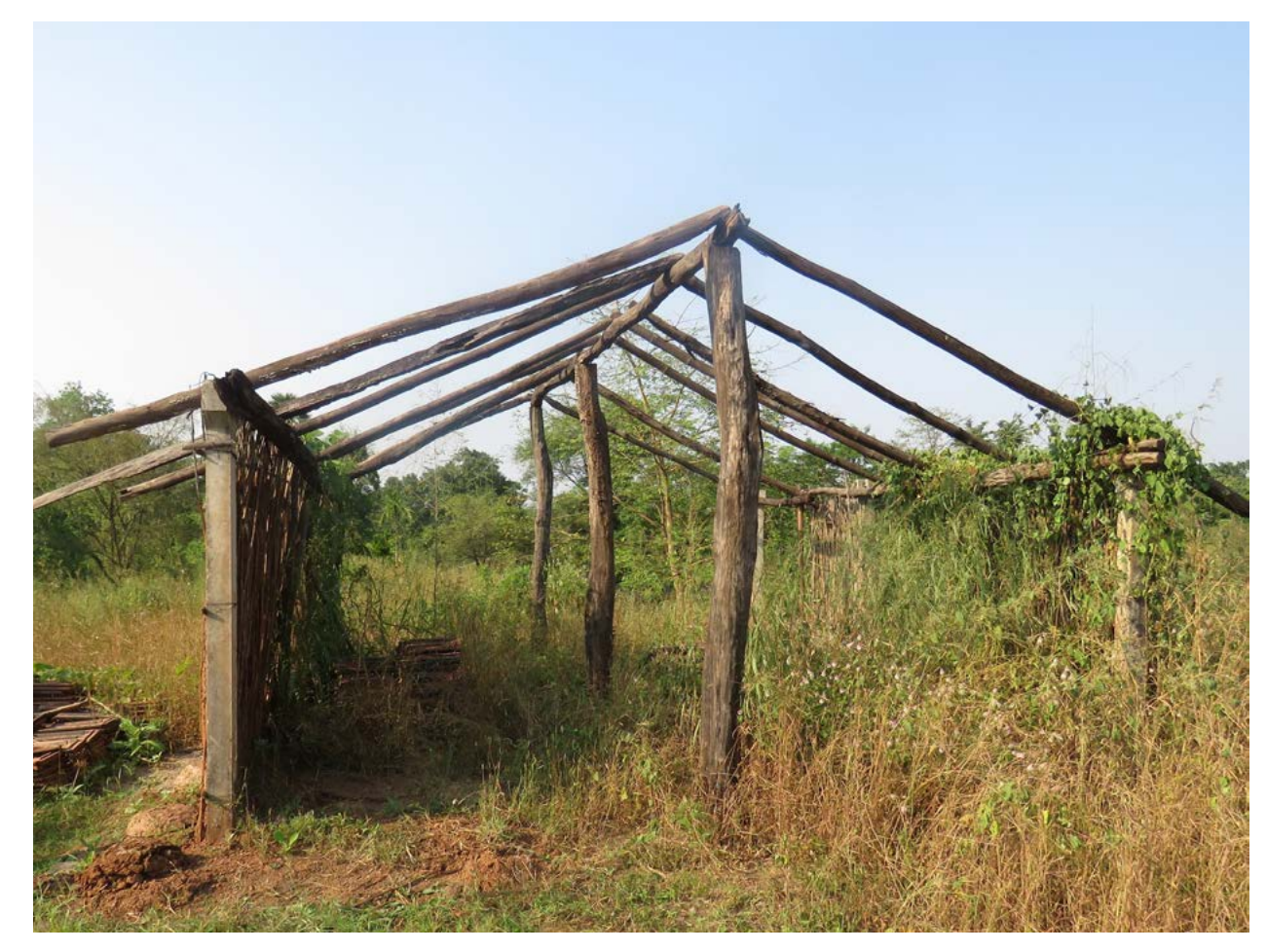
Plate 2: Warlis house framework, Dahanu, Maharashtra, India.