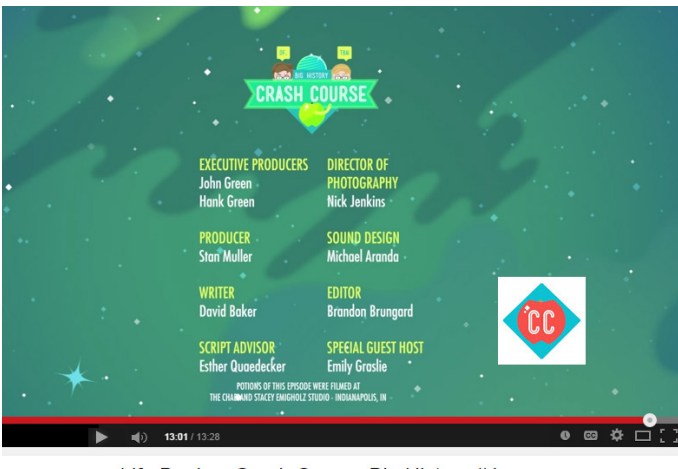
Life Begins: Crash Course Big History #4