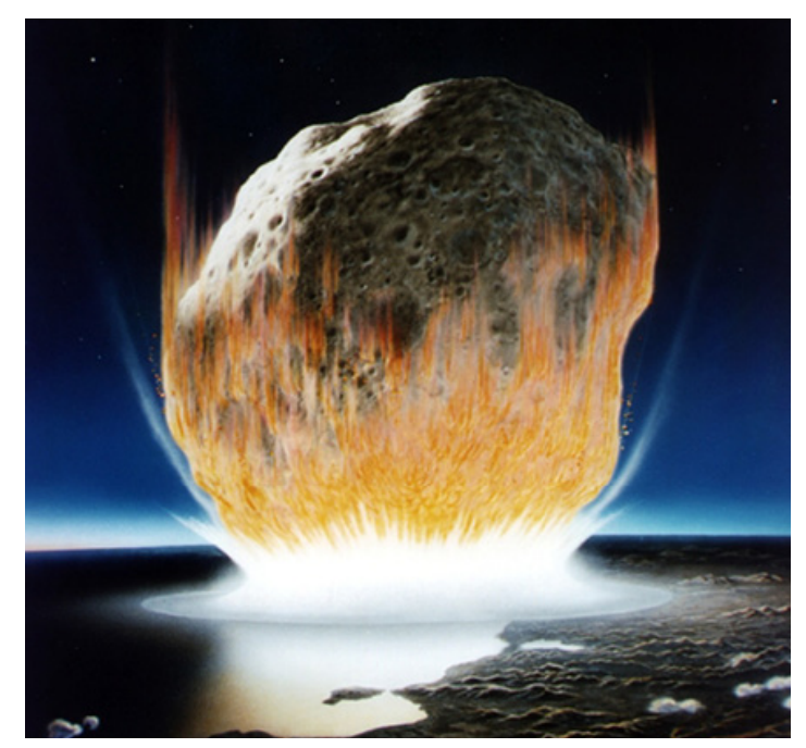
Time Scale 3: Dinosaur Extinction and the Rise of Mammals

The Stone Age Institute's, Big History museum exhibit, "From the Big Bang to the World Wide Web: The Origins of Everything," opened in October, 2010 at the Mathers Museum of World Cultures at Indiana University, Bloomington, (http://www. bigbangtowww.org/index.php/about-the-museumexhibit). This long-term exhibit features hundreds of specimens and presently comprises 2,500 square feet of exhibit space. Funding for this exhibit came from the federal government (Institute of Museum and Library Services), with matching support from Indiana University and the Stone Age Institute (www. stoneageinstitute.org). Notable items in the exhibit include the earliest known matter in the solar system, a 4.6 billion-year-old Murchison carbonaceous chondrite meteorite that fell in Australia in 1969; the oldest known Earth rocks from the Canadian shield (donated by the principal investigators); pieces of the moon and the planet Mars (that fell as meteorites in North Africa); the earliest known organic fossils and stromatolites; banded iron formation; Snowball Earth tillite: Ediacaran and Cambrian fossils: casts of fossil chordates, fish, amphibians, reptiles, mammals, primates, and hominins, including lifesized replicas of a T. rex skull and a Neanderthal skeleton; early examples of stone tools, palaeolithic art (including a walk-in replica of a palaeolithic art cave), pottery, farming, metallurgy, writing,